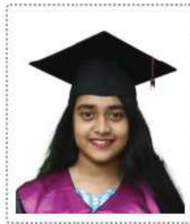
Mubashera ID: 357826