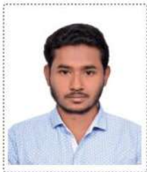
Stalin Dhali ID: 967008