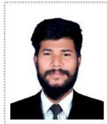
Akash ID: 149238