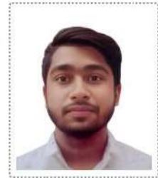
Sifat miah ID: 149258