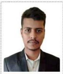
Sheikh Yousuf ID: 187760