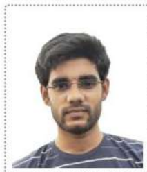
Nayan ID: 966994