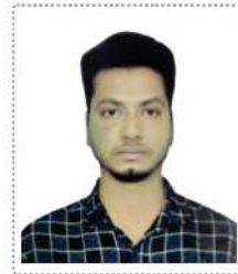
Imran Khan ID: 981509