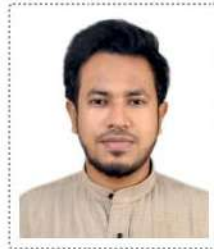
Sultan Mahmud ID: 305116